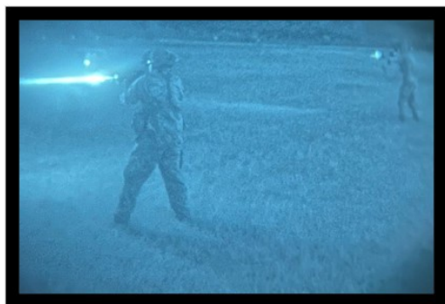
2/C conducting Short-Range Marksmanship at night