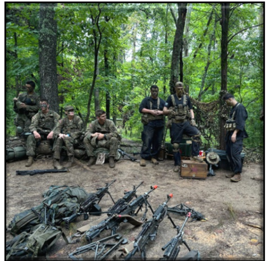
D Co OPFOR providing AAR to cadets at CST